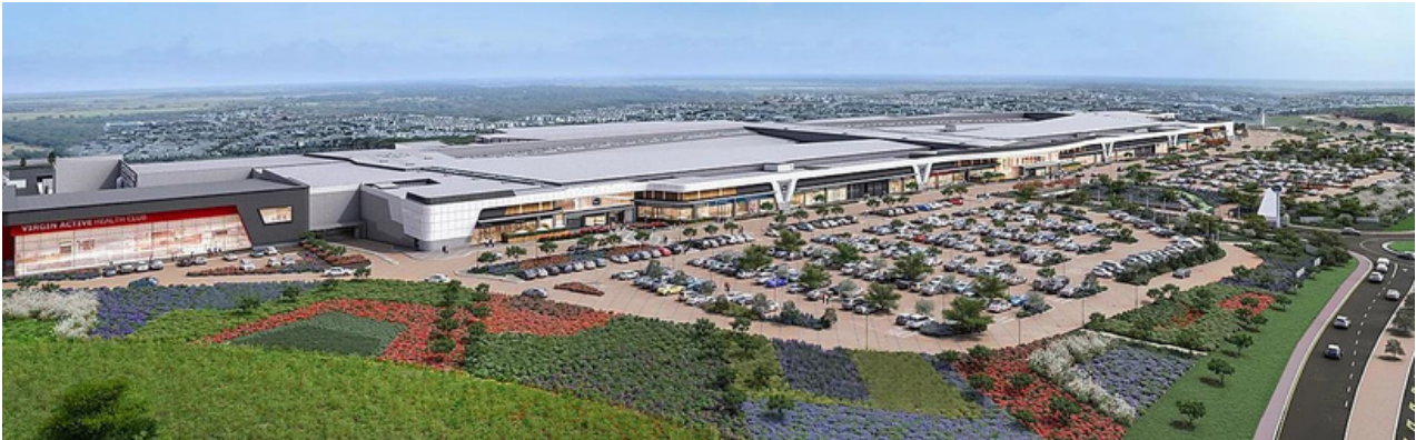
TABLE BAY SHOPPING CENTRE