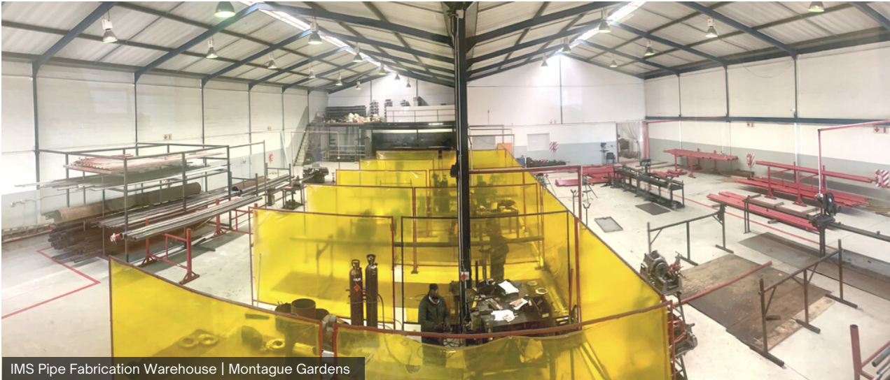
IMS Pipe Fabrication Warehouse | Montague Gardens

QD Fire utilises IMS Pipe Fabrication for all our cutting list manufacturing as well as our material supply. IMS Pipe Fabrication is a member of the QD Holdings Group and provides pipe fabrication for many fire protection companies within the fire protection industry.